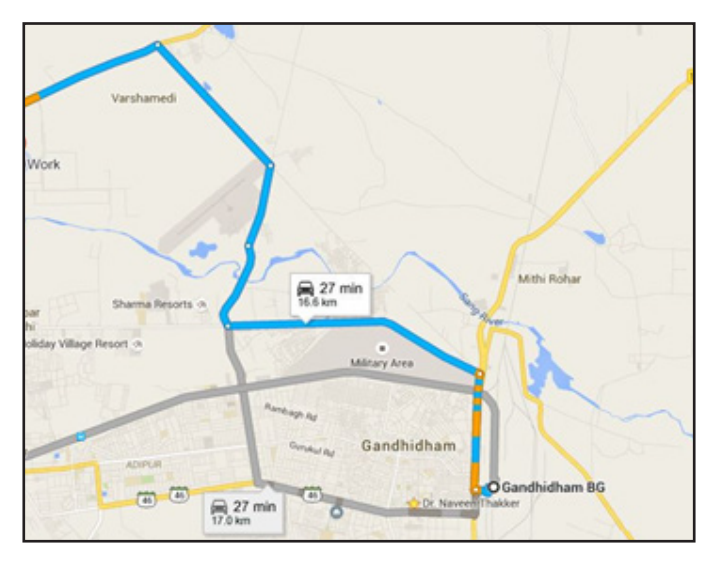
Route Map-Gandhidham Station to Welspun